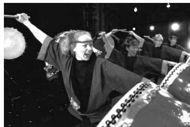
Mu Daiko Drummers