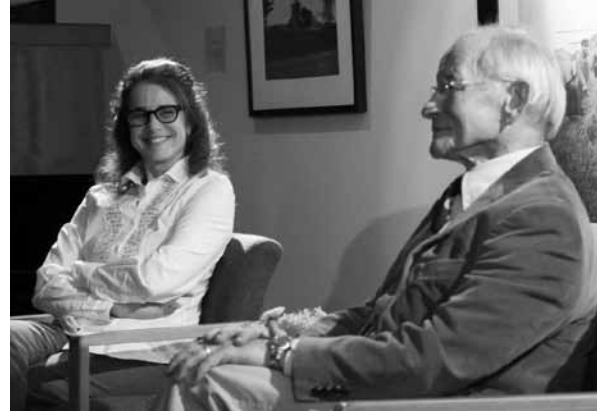
Debra Winger and Ted Kooser

Actress Debra Winger read from her 2008 collection Undiscovered . Celebrated for her performances in some of the most memorable films in the last 30 years – An Officer and a Gentleman , Terms of