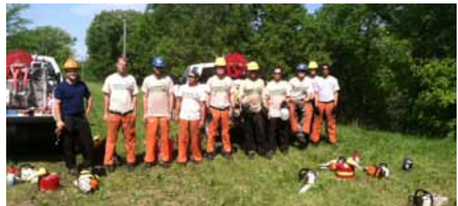
Audubon Minnesota crew.

improve habitat for birds and other wildlife on the Center's property. Phase One of the project included removing invasive species of buckthorn and Asian honeysuckle on 10 acres of the property overlooking the Cannon River floodplain to promote natural regeneration of native trees and shrubs.