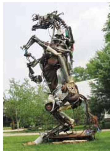
Bucaphalos by artist Al Wadzinski

showroom sculptures that are nothing less than astonishing in their scale and composition. Bucaphalos , or The Horse , as it is affectionately called, is a familiar example of Al's large scale work and currently resides in the courtyard between the historic residence and the water tower at the Center.