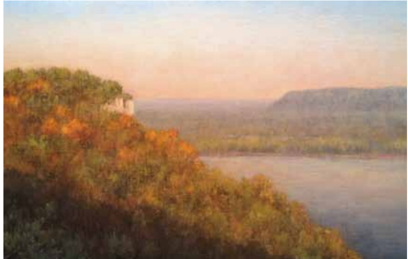
Painting by landscape artist Sara Lubinski

The stories Lubinski tells with her paintings are layered in the many textures and mysteries of the Mississippi River world. "I am nourished by nature,"