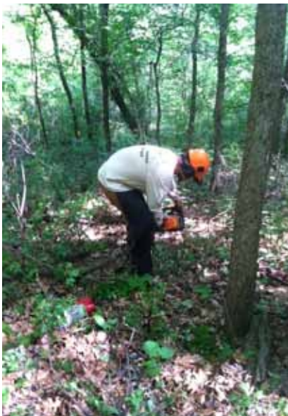
Anderson Center CCM crew cutting buckthorn.

Audubon Minnesota, with funding from the Carl and Verna Schmidt Foundation and the Mortenson Family Foundation, is working with the Center to